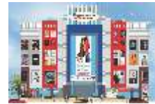
P SQUARE MALL Civil Lines