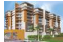
PARAS KUNJ Mahewa