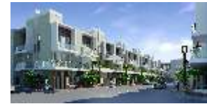
PRITHVIKUNJ Pretam Nagar