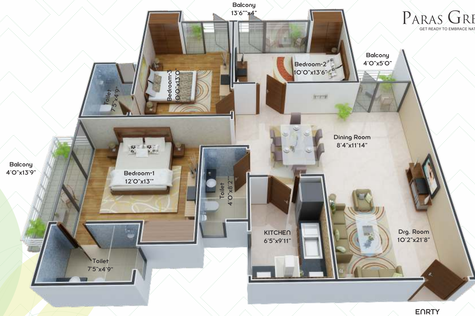
Type-B, 3BHK+3T, Builtup Area-1156sqft, Super Builtup Area 1395sqft.