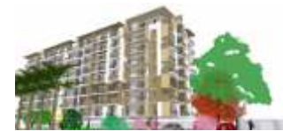
PARAS RESIDENCY Strachey Road