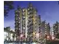
PADAM ENCLAVE Dandi